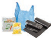
Plastic film, carrier bags & bin liners